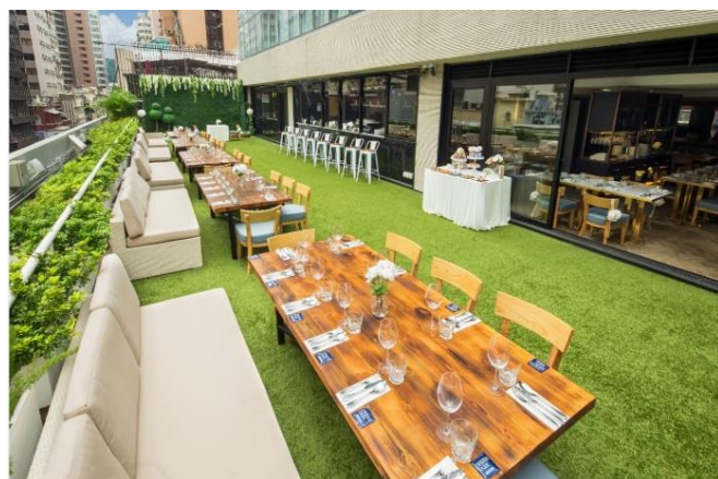
Romantic garden setting – 50 pax